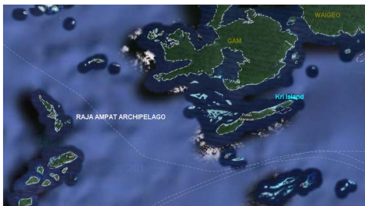
Kri Eco Resort, Raja Ampat